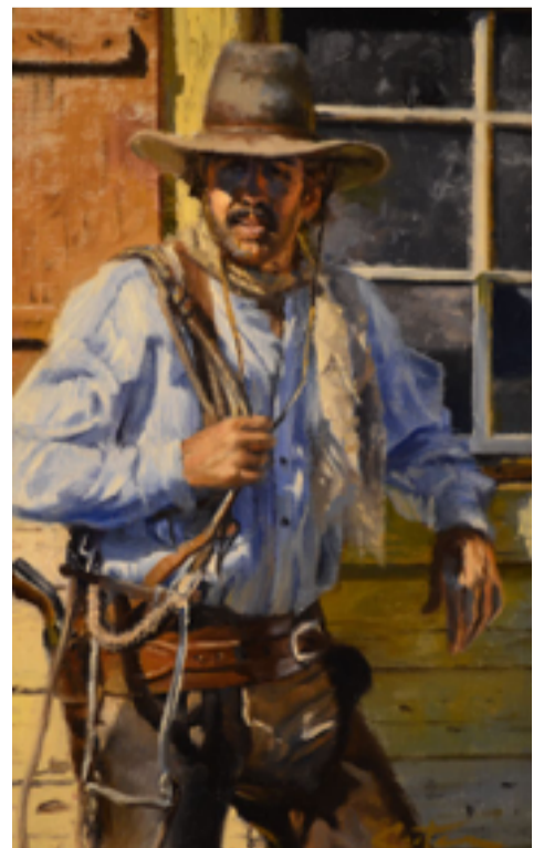
Image: Cowboy Reverie, 16 x 10